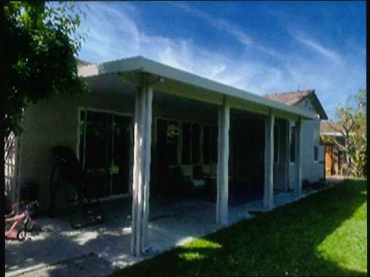
Classic IRP house wall attached with standard 2x6 post wraps, and a single 3x8 beam.

Elitewood's™ Insulated Roof Panels create a noise absorbing patio cover system that reduces the loud sounds made by heavy rain and hail. This insulated sound absorption is not common with "single skin" or non-insulated patio cover systems.