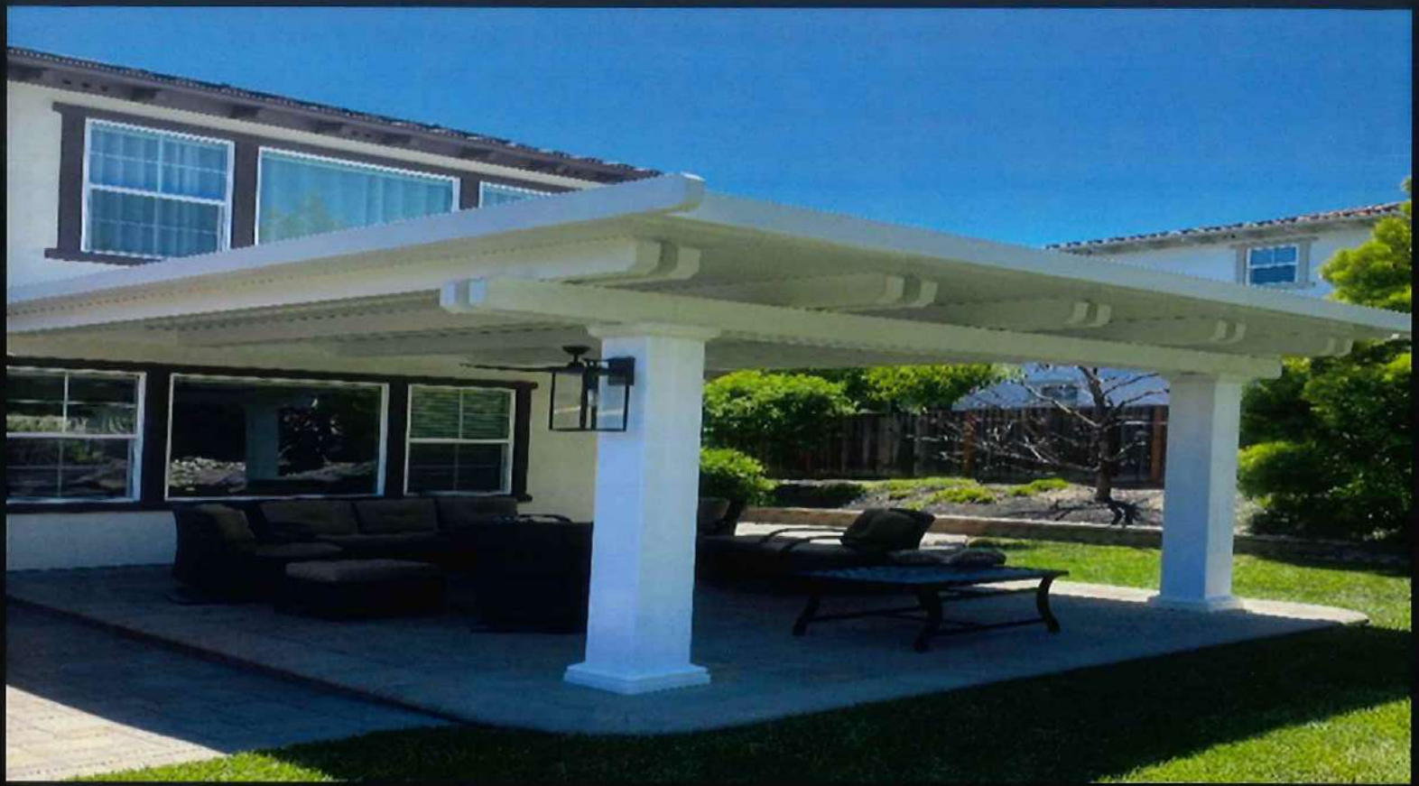
Cedar IRP with double 3x8 rafters, 3x8 beams, 3x8 wrap, and 10" square fiberglass columns