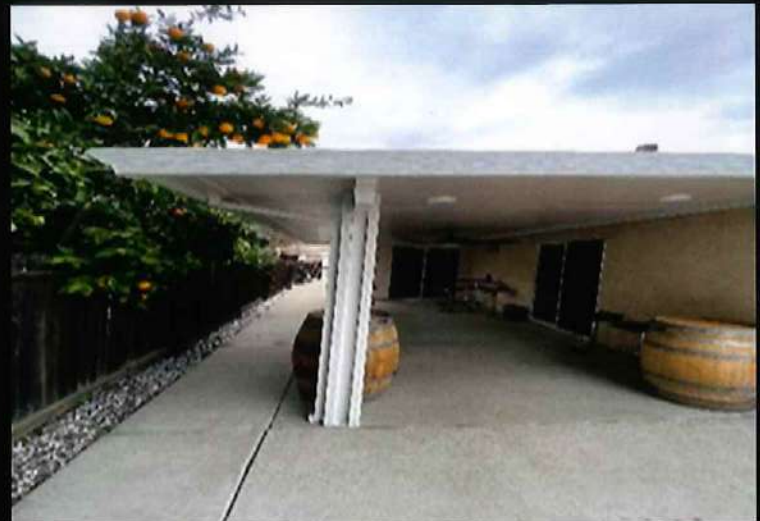
Driftwood IRP cover eave attached with single 3x8 beam, and standard post wraps.